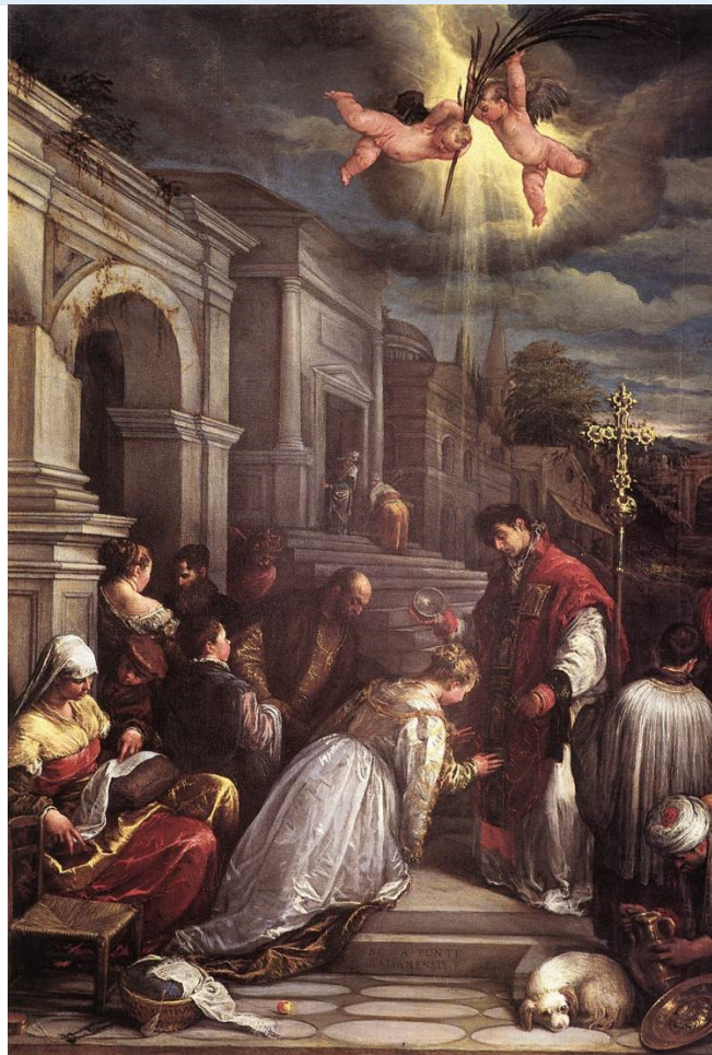
St. Valentine Baptising St. Lucilla Jacopo da Ponte 1575 Museo Civico, Bologna, Italy

EXTRA: The February EXTRA newsletter is available on the website this weekend. Please bring to everyone's attention as it is a special LENTEN EDITION with information of many things going on during lent, including Stations of the Cross, Evening Prayer Services, Lenten Alms, CAFOD's Walk for Water and Lent Fast Day and Fair Trade Fortnight, as well as an online Lenten Retreat, Holy Week Voices from the Holy Land, and Easter Parcels, plus messages from J&P, the Evangelisation team and UNITE Catholic Youth.