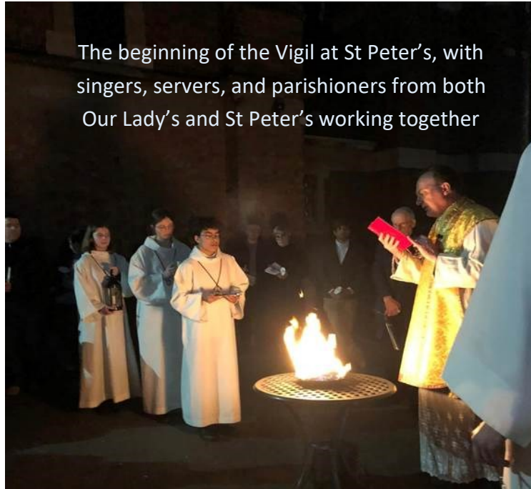
The beginning of the Vigil at St Peter's, with singers, servers, and parishioners from both Our Lady's and St Peter's working together