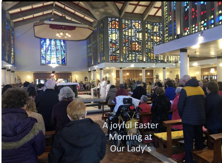
A joyful Easter Morning at Our Lady's