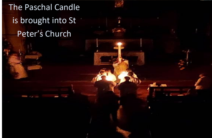
The Paschal Candle is brought into St Peter's Church