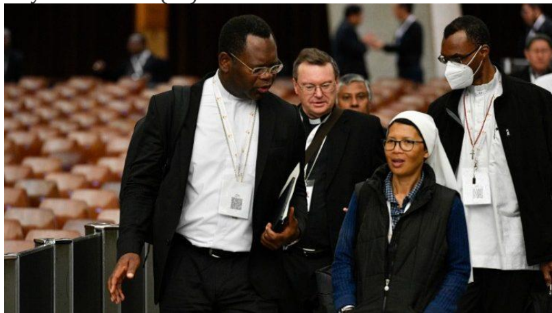
Some of the participants in the General Assembly

The document continues explaining that synodality goes hand in hand with mission. Hence, it is necessary that “Christian communities are to enter into solidarity with those of other religions, convictions and cultures, thus avoiding, on the one hand, the risk of self-referentiality and self-preservation, and on the other hand the risk of loss of identity” (2 e). In this new “pastoral style”, it would seem important to many to make “liturgical language more accessible to the faithful and more embodied in the diversity of cultures” (3 l).