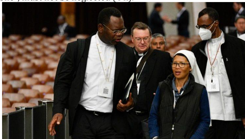
A pause during the work of the General Assembly

In this sense, the Church is urged to be committed both to the “public denunciation of the injustices” perpetrated by individuals, governments, and companies; and to active engagement in politics, associations, trade unions, popular movements (4f and 4g). At the same time, the consolidated action of the Church in the fields of education, health, and social assistance, “without any discrimination or the exclusion of anyone”, must not be neglected (4 k).