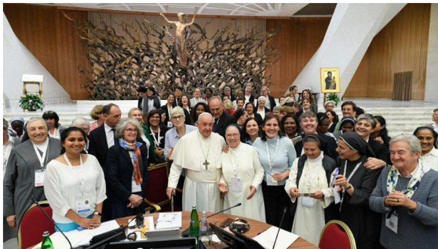
Pope Francis with some of the women participating in the synodal assembly

There is, then, a call for a strong commitment on the part of the Church to accompany and understand women in all aspects of their lives, including pastoral and sacramental ones. Women, it says, “cry out for justice in societies still marked by sexual violence, economic inequality and the tendency to treat them as objects” (9 c), adding “Pastoral accompaniment and vigorous advocacy for women should go hand in hand”.