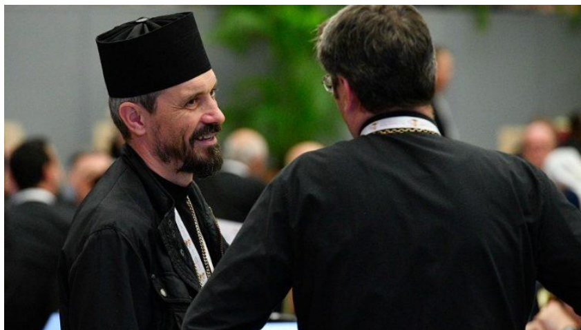
Some of the participants in the General Assembly

Remaining on the subject of migration, the Report looks to Eastern Europe and the recent conflicts that have caused the flow of numerous faithful from the Catholic East into territories with a Latin majority. It is necessary, the Assembly says, “for the local Latin-rite Churches, in the name of synodality, to help the Eastern faithful who have emigrated to preserve their identity and cultivate their specific heritage, without undergoing processes of assimilation is the request of the Fathers” (6c).