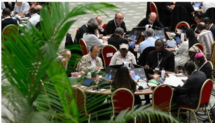
One of the small groups

new questions” in society and in the Church (15 g). “It is important to take the time required for this reflection and to invest our best energies in it, without giving in to simplistic judgments that hurt individuals and the Body of the Church”, the Report says, while recalling that “Church teaching already provides a sense of direction on many of these matters, but this teaching evidently still requires translation into pastoral practice”.