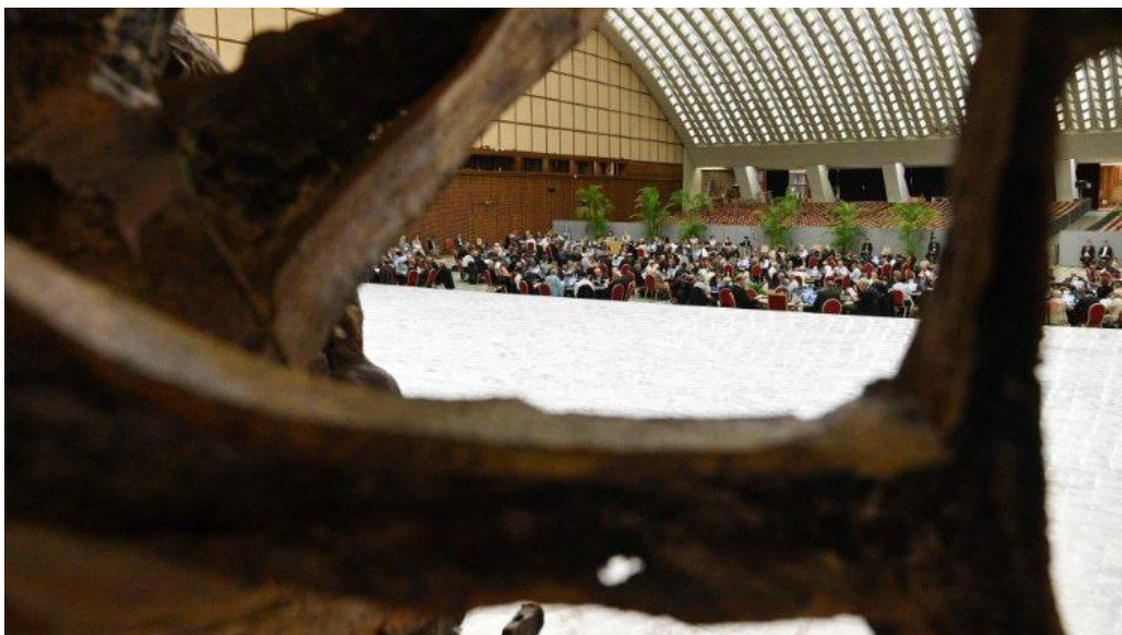
The Assembly at work in the Paul VI Hall

The document of some forty pages is the result of the work of the assembly that took place “while wars both old and new have raged in the world, with dramatic consequences that are impacting upon countless victims.” The report continues, “The cry of the poor resounded among us, of those forced to migrate and of those suffering violence and the devastating consequences of climate change. We heard their cry not only through the media, but also through the voices of many present, who were personally involved in these tragic events whether through their families or their people” (Foreword). To this challenge and many others, the universal Church has tried to offer a response in the Small Circles and in the interventions. Everything came together in the Synthesis Report, which is divided into a preface and three parts, and which traces the path for the work to be done in the second session in 2024.